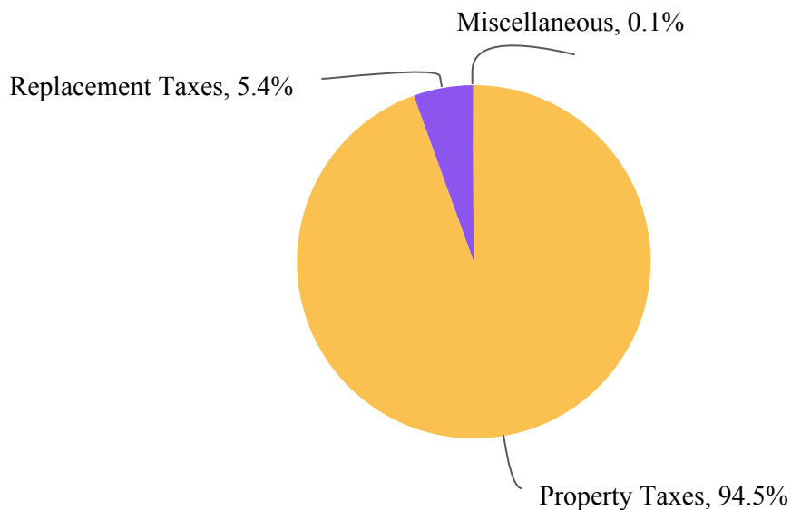
Revenues by Source - Governmental Activities

The following table graphically depicts the major revenue sources of the District. It depicts very clearly the reliance of property taxes and to fund governmental activities. It also clearly identifies the less significant percentage the District receives from replacement taxes.